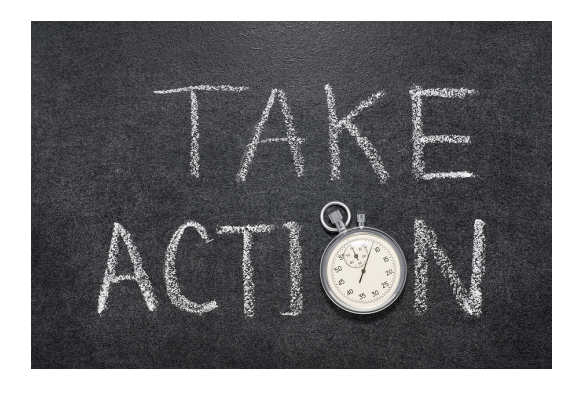
From Autism Action Network