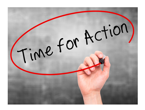
From Autism Action Network