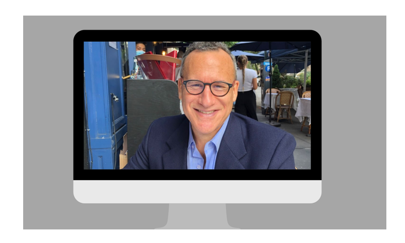
Stay Connected With Us!