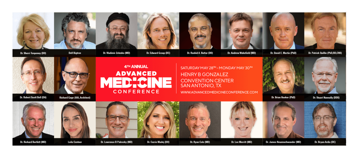
Don't Miss the 4th Annual Advanced Medicine Conference in San Antonio, Texas

Register with code MLX100 for $100 off: <a href="http://ow.ly/Q9w950IaAEH">http://ow.ly/Q9w950IaAEH</a>