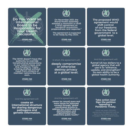
What the WHO...? | Stand for Health Freedom

At an unexpected meeting in November 2021, the World Health Organization Assembly met and voted to create an Intergovernmental Negotiating Body to strengthen the authority of WHO governance of global health responses. The group wants to expand and strengthen the powers of the WHO by creating a treaty or agreement where the 194 nations and territories that are members of WHO would be legally bound to global pandemic emergency protocols.