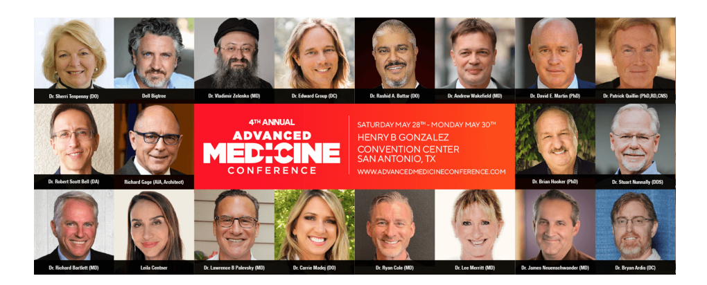
Don't Miss the 4th Annual Advanced Medicine Conference in San Antonio, Texas